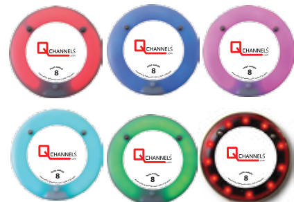
WaterProof DropProof Pager