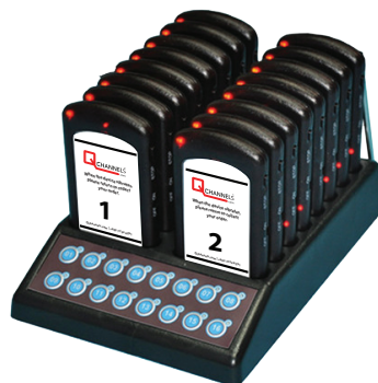
Slim Pager Transmitter (with Charger Base)